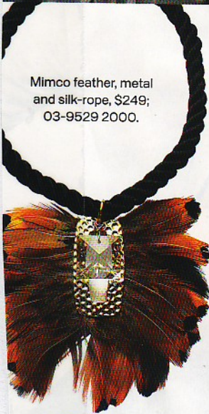
Mimco feather, metal and silk-rope, $249; 03-9529 2000.