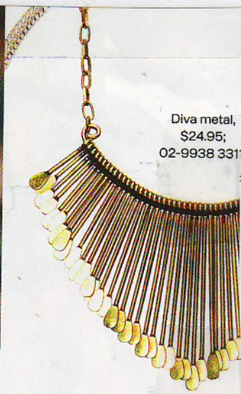
Diva metal, $24.95; 02-9938 3311