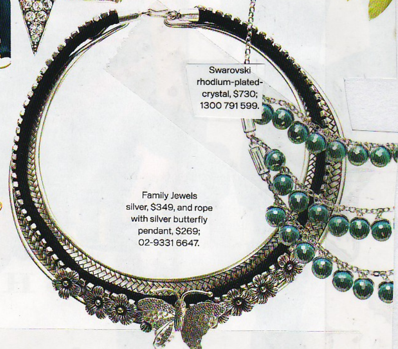
Swarovski rhodium-plated- crystal, $730; 1300 791 599.