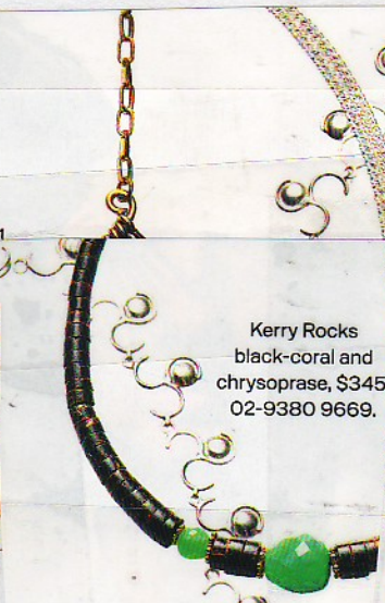
Kerry Rocks black-coral and chrysoprase, $345; 02-9380 9669.